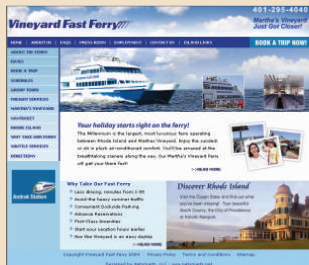
Website for Vineyard Fast Ferry www.vineyardfastferry.com