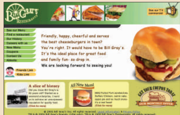
Website for Bill Gray's www.billgrays.com