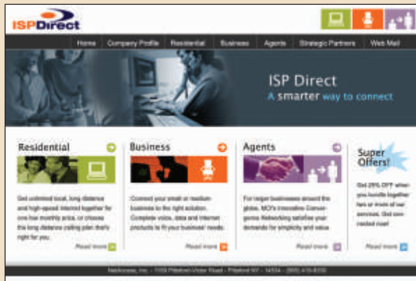
Website for ISP Direct www.ispdirect.net