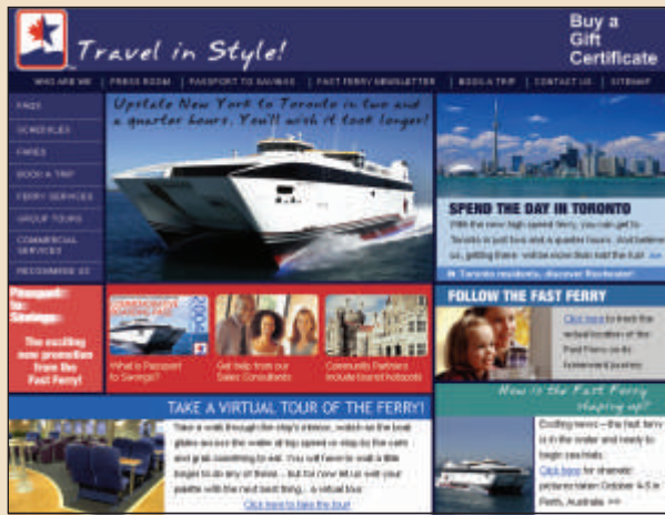
Website for CATS Fast Ferry www.thebreeze.com