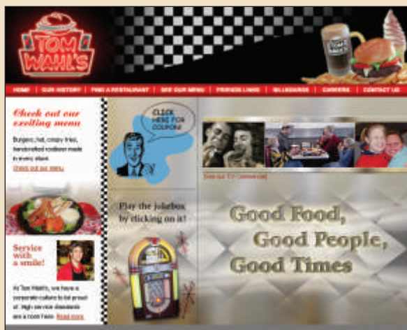
Website for Tom Wahl's www.tomwahls.com