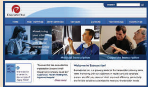
Website for Execuscribe www.execuscribe.com